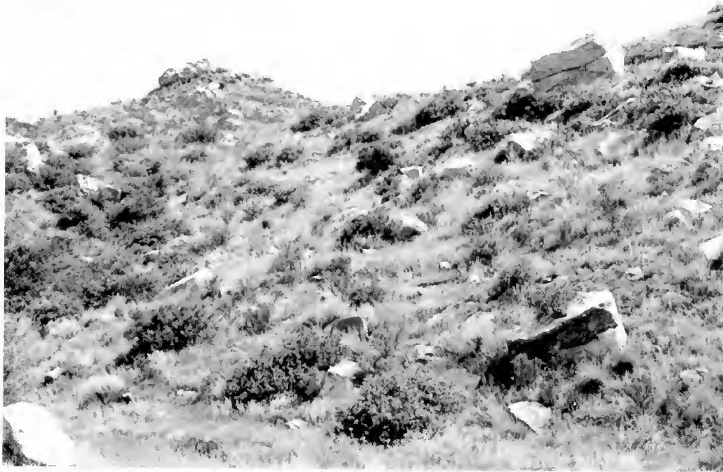
Figure 3. Typical rocky upland habitat at Lake Meredith National Recreation Area. Note common shrub and grass species amongst the boulders.

areas. The individual we took (collected on 10 July) was a male with testes that measured 10 x 5.